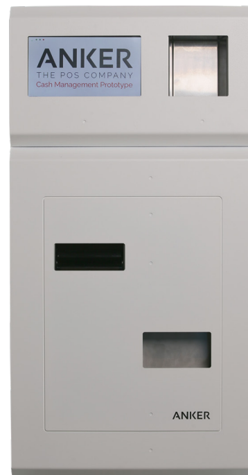
Cash recycler front view