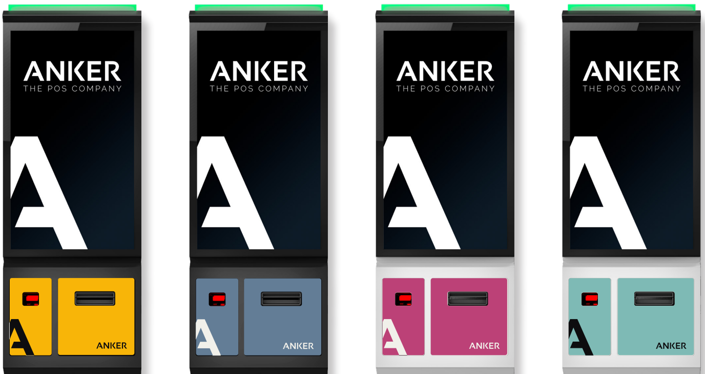
Samples of interchangeable design panels

We can provide the design panels in all common RAL colours . No matter whether it's a corporate colour, a favourite colour or something really unusual. We deliver the self-checkout in your desired colour!