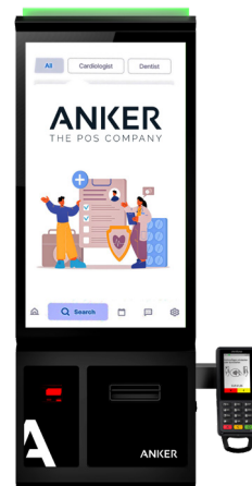
SCO in RAL 9016 white