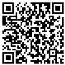
S410 3D demo