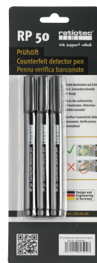
RP 50 set of 3