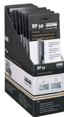
RP 50 set of 10 (display box)